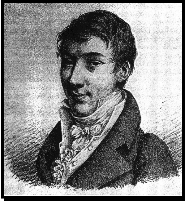
Augustin-Louis Cauchy (1789-1857)

Augustin-Louis Cauchy was a French mathematician who was an earlier pioneer in analysis. He is one of the first mathematicians to raise the level of rigor to what we have today.